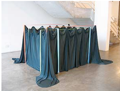
Katy Heinlein Untitled 2006 Cloth and wood 60 x 72 x 84 inches

MW: Right, and while Suddath's work functions as a nonreferential object, ties to industrial or mass consumption and to acts of labor and commerce are evident in the handmade care that went into its fabrication. You can't avoid them, but it helps his forms do such an amazing job of inviting but then blocking metaphoric associations. Suddath's working process is very different from the modernist act of creating an autonomous object that is totally